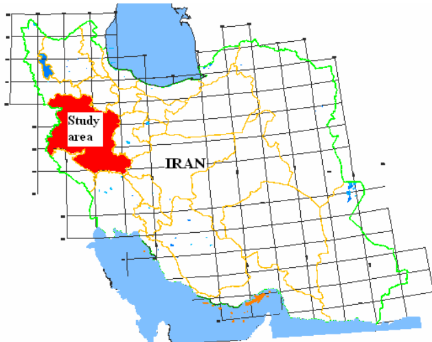
Figure 1. Map of Iran showing the study area which include the four sampling zones; Lorastan, Kordestan, Hamadan and Kearman-shah.

(total rainfall and snowfall) is 550, 450, 350 and 470 mm and mean annual air temperatures of the regions are 17, 13.1, 12 and 13°C, respectively. Based on the Koppen climatological classification, the climate of Lorastan, Kordestan, Hamadan and Kearmanshah are Cfa, Dfa, Bfh and Cfa, respectively. The climates of regions are correlated with altitude variations. At lower elevations (less than 2500 m) rainfall commonly occur during the fall and winter months. Above this elevation, snowfall occurs during winter and at the fall, but rain is also dominant precipitation. Generally, in all of area, during the April and March, precipitation is often minimal but the rainfall events occur with high intensity.