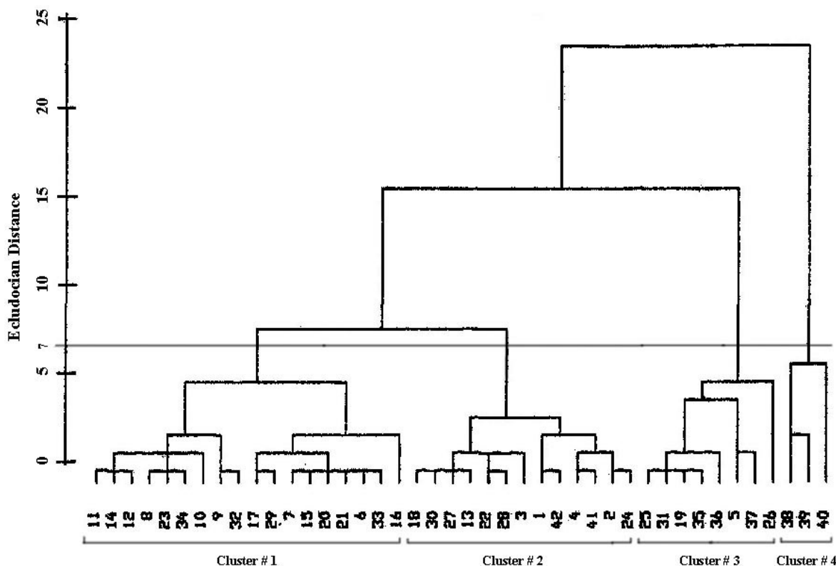
Figure 2. Dendrogram of 42 G. herbaceum varieties generated by karyological data using the UPGMA method (See Table 1 for nomenclature).

temperature (some region with 54°C). All of collected landraces are planted traditionally in around of central areas (falat) of Iran, which have arid, semiarid and desert conditions. According to cluster analysis, the studied cotton varieties divided into four clusters. Most cultivars were presented in the first and second clusters (18 and 13 cultivars, respectively). These results are nearly similar to the morphological characters clustering reported elsewhere (Sheidai and Alishah 1998).