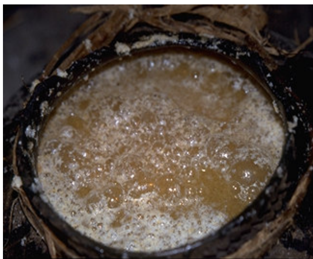
Figure 3. Vigorously fermenting mash of ogol , the traditional honey wine of Southwest Ethiopia.

After 1 night to 3 days, the fermented mash was ready to be drunk (Figure 3). It was strained to prepare the ogol . The residue composed of the bark and viable yeast cells was recycled to prepare bite for the next batch of ogol brewing. When recycled bark containing yeast cells was used, it took only 2 to 3 days to prepare the bite for the next batch.