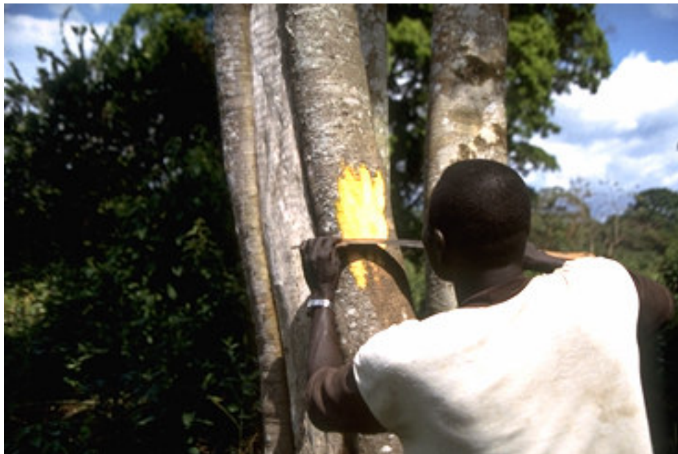
Figure 1. The bark of mange ( Blighia unijungata Bak) used for ogol brewing.