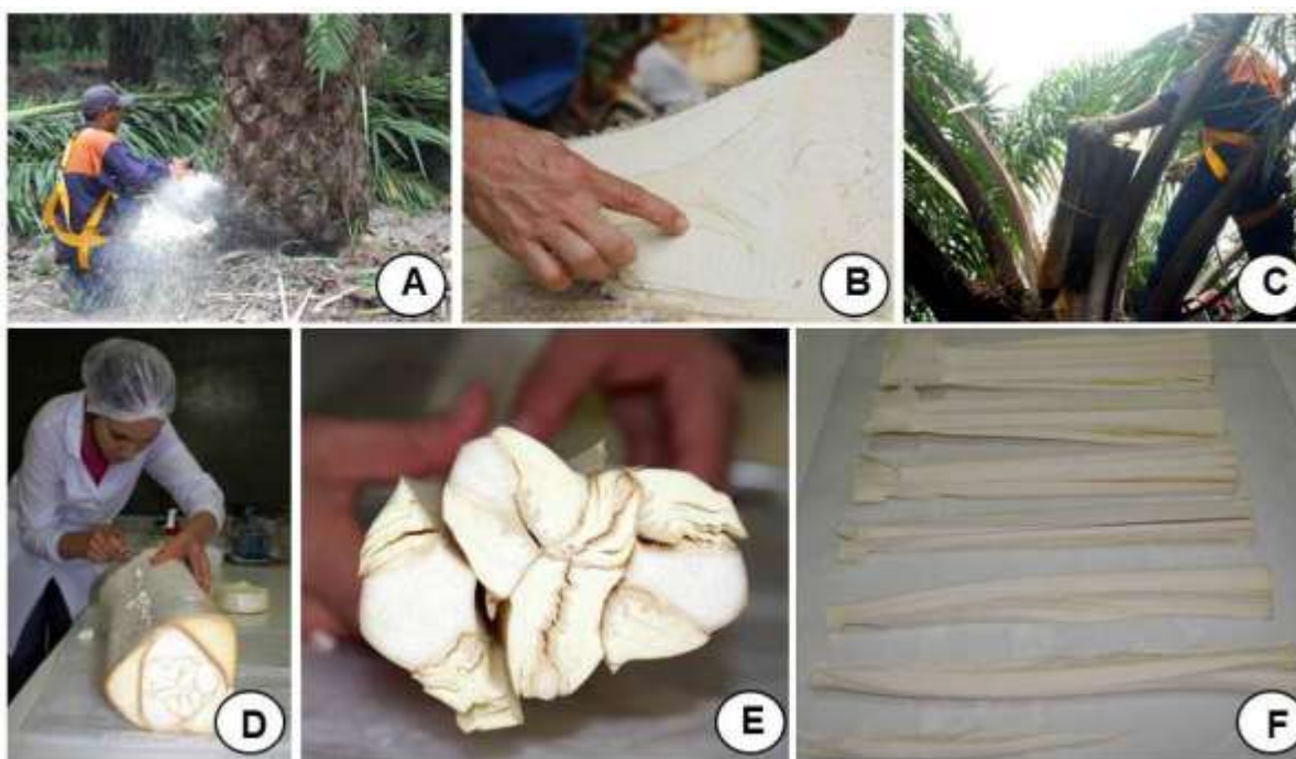
Figure 1. Apical meristem referencing procedures for safe palmetto extraction and obtaining of leaf explants to induce somatic embryogenesis in oil palm. A: Cutting of an adult plant oil palm to perform stem slitting and measurements, in order to secure palm extraction without compromising the apical meristem. B: Referencing safety for cutting palm hearts, where the arrow indicates the region of apical meristem. C: Palm extraction based on measurements done by a professional. D: Removal of external palm leaf layers of protection for leaf explant preparation. E- F: Immature leaflets individually separated for the induction of somatic embryogenesis in oil palm

Culture at the Federal University of Viçosa, in Viçosa/MG, Brazil. After 72 h of material removal in the laboratory, the palmitos were sanitized externally with 70% alcohol and external leaf layers were carefully removed (Figure 1D), being the immature leaves separated in seven layers: Leaf- 1 (most external) to Leaf- 7 (most internal) (Figure 1E and F) (Corley and Tinker, 2003). Next, the leaflets of each leaf were detached from the rachis, with 1/3 of the leaflet apex being eliminated. The leaflets were then submitted to disinfection with sodium hypochlorite (1% of active chlorine) for 20 min and rinsed successively eight times in sterile deionized water in laminar flow chamber. After disinfection, the leaflets were sectioned transversally into 1 cm segments of length, which were used as