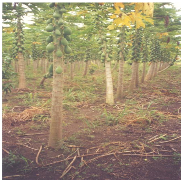
Figure 1 . Papaw – trees and papaya fruits.

- : Standstill + : Backward ++ : normal +++ : More marked.