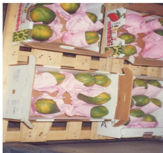
Figure 3. The papaya samples are arranged in a fruit expedition cardboards