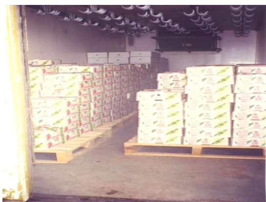
Figure 2. Conditioning in a container of the cardboards of papaya (conservation surrounding wall).

Observations take place inside the enclosed cold room (conservation surrounding wall), safe from the solar light and with the help of torchlight. There are four stages of maturity of the papaya: