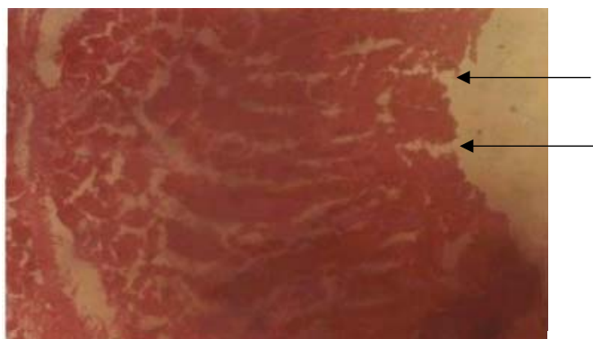
Figure 2. Histopathological section of the small intestine of rat dosed with L. acidophilus and challenged with E. coli . Arrow shows area where the intestinal villus pattern was slightly eroded (X 100).