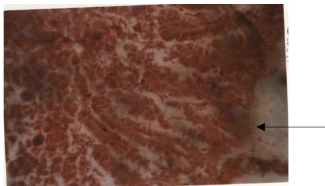
Figure 3. Histopathological section of the small intestine of rat challenged with E. coli . Arrow shows area where the intestinal villus pattern was markedly eroded (X 200).

treated with Lactobacilli (Table 2). A slight decrease in enterobacteria count was also observed in most of the rats. There was increase in the enterobacteria and Lactobacilli count from day zero (0) to day 3 in both controls (C and CT). In a similar study, Chang et al. (2001) reported an increase in the Lactobacilli count in faeces of rat that was fed basal diet devoid of probiotic agent. The high Lactobacilli count in groups treated with Lactobacilli and E. coli (CA and CC) may be responsible for the partial protection of the GIT of rats in these groups.