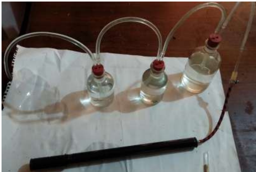
Plate 1. Photograph of assembled pump sampler for shallow water bodies.

b. Connecting tubes for the bottles and pump cut as follows: 30 cm length: six pieces for 5 bottles and the suction pump = 180 cm; used plastic tube (total length) = 252 cm.