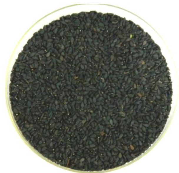
Figure 6. Bright black coloured seed, code-12.