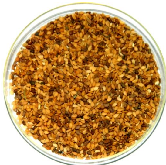
Figure 3. Light brown colored seed, code-4.