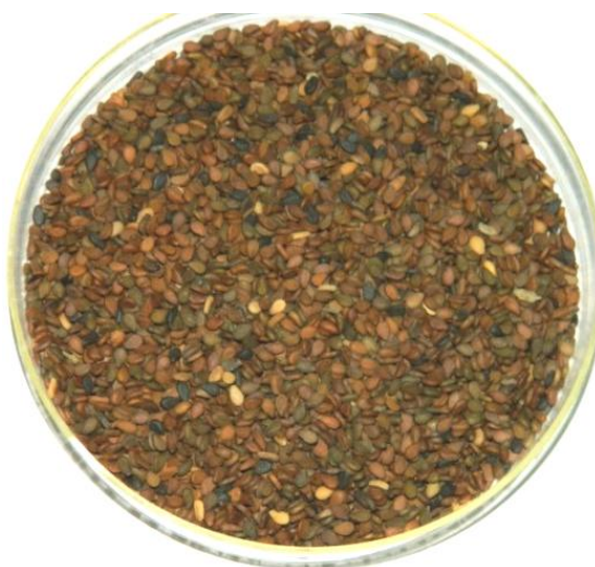
Figure 4. Medium brown colored seed, code-5.