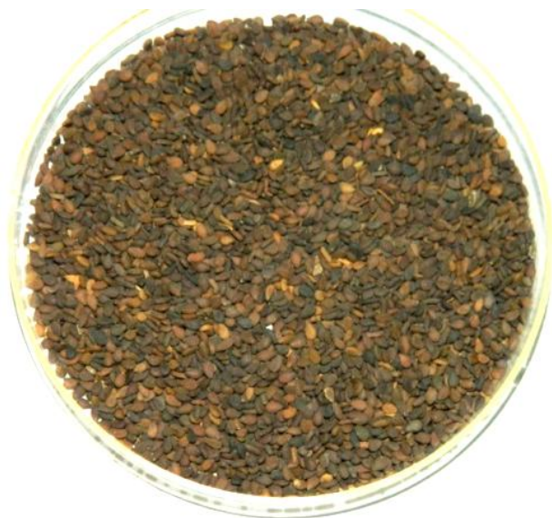
Figure 5. Dark brown colored seed, code-6.