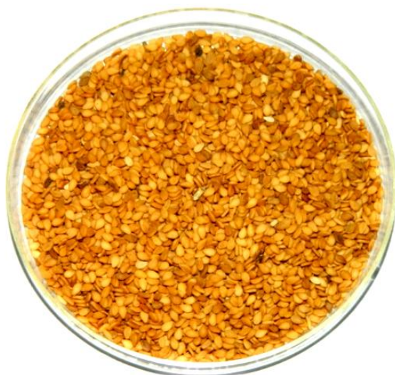
Figure 2. Beige colored seed, code-3.