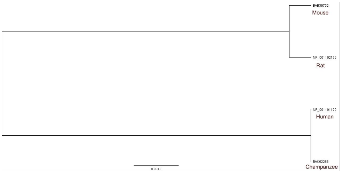
Figure 1. Phylogenetic analysis of protein sequences.

variant-7 mRNA sequence was performed through the Geneious software using Tamura-Nei Algorithm (Tamura and Nei, 1993). The UPGMA rooted tree diagram of H. sapiens tumor protein p73 (Tp73), transcript variant-7 mRNA sequence showed different clusters formation. Organism that originated from same ancestors having same e-value and 100% pair wise identity were placed in same clusters whereas those which are distant from each other were placed in separate clusters.