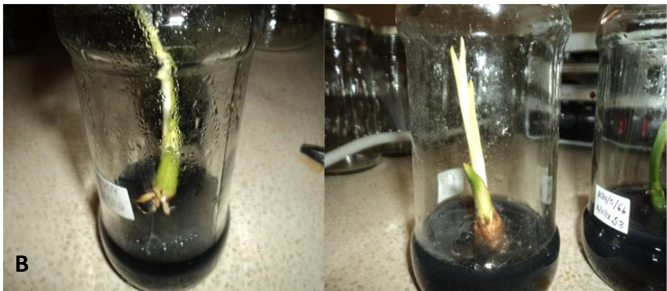
Figure 1. (a) Secondary root development. (b) Plantlets with enlarged haustorium and secondary root development.