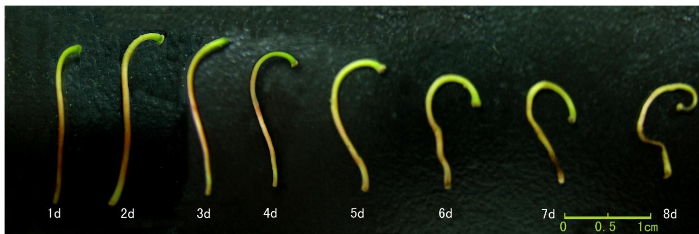
Figure 2. Morphological characters of stigma.

The pollen viability of three cultivars were maintained for 33 h in 'Hong Wei', 33 h in 'Zi Wei' and 51 h in 'Yin Wei'. In the natural environment, the pollen viability was less than 10% (data not shown) at 5:00 am when the corolla just surpassed the calyx. In 'Hong Wei', the real pollen viability was 27.5% at 7:00 am 1 DA, which increased very significantly to the peak (44.8%) at 10:00 am and decreased to 16.3% till 13:00 pm, 21.1% at 16:00 pm of 1 DA. It later increased significantly to 30.2% at 7:00 am of 1 DAA, then decreased to 22.3% at 10:00 am of 1 DAA and decreased very significantly to 10.8% at 13:00 pm of 1 DAA, before it lost vigor at 16:00 pm of 1 DAA.