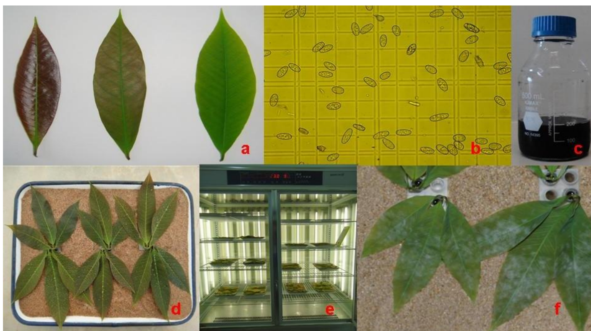
Figure 1. In vitro culture of powdery mildew ( Oidium heveae ) of Hevea brasiliensis . a, three kinds of phenological phase leaves of bronze, Colour and light green of GT1; b, fresh powdery mildew asexual conidia; c, NS7 nutrient solution; d, Colour phase leaves with nutrient solution in culture dish; e, in vitro culture in climate incubator; f, Colour phase leaves cultured for 9 day of GT1.

consequently aid in its research and improve rubber resistance breeding process. In this study, the influences of 6-benzylaminopurine (6-BA), salicylic acid (SA) and vitamin C (VC) of nutrient solution for in vitro culture were investigated by orthogonal experimental design.