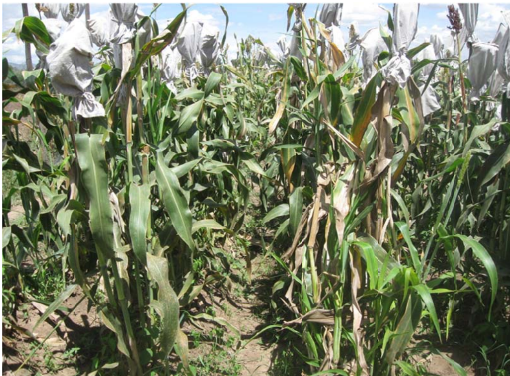
Figure 2. Differences in leaf senescence in the stay-green introgressed line, Meko x B35 (Left) and its recurrent parent Meko (Right) under water deficit condition (to the extreme left is a border row).