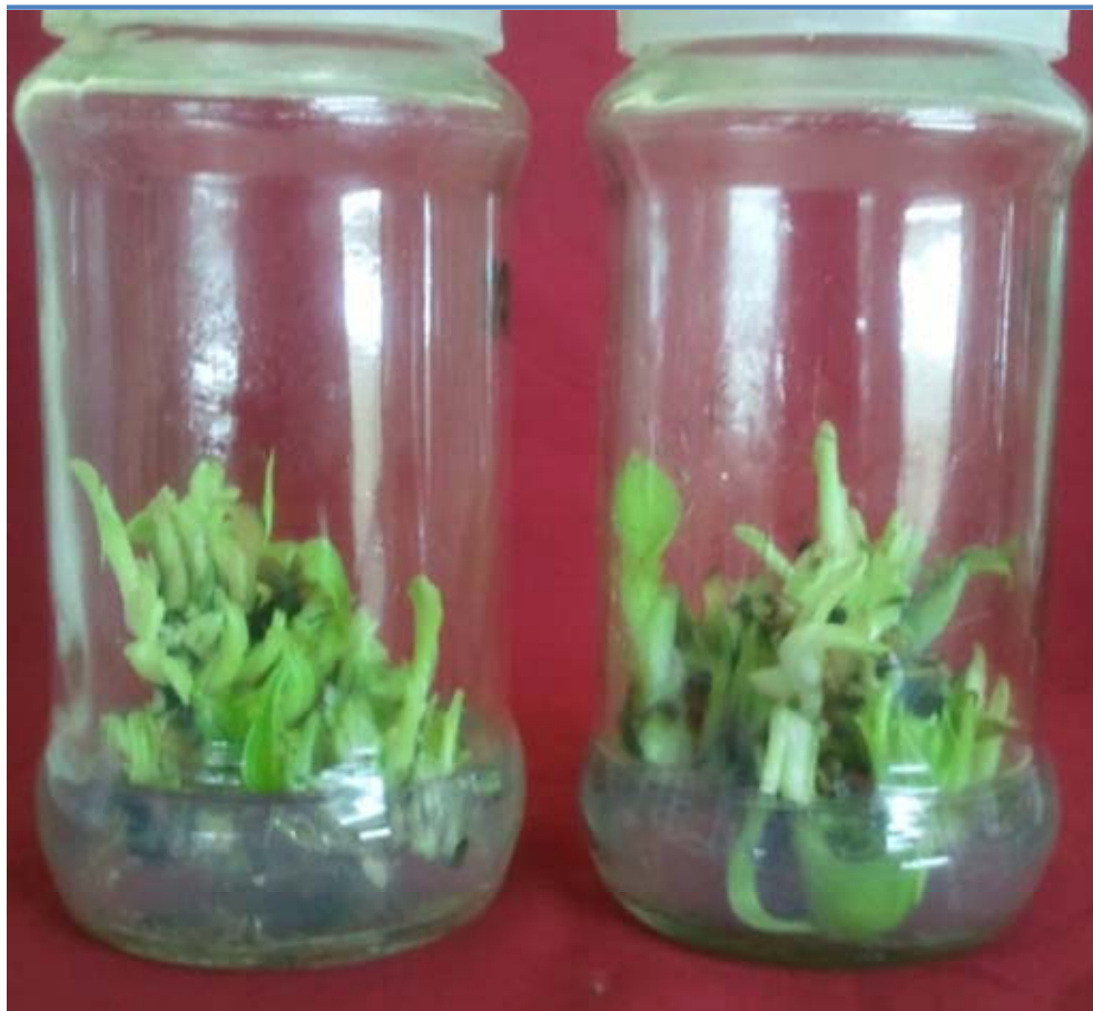
Figure 3. Culture proliferation of banana explants cv. Grand Naine.

Values in bracket indicate that they are transformed values. Data recorded for different parameters were subjected to completely randomized design (CRD). Statistical analysis by (ANOVA) technique of CRD software used for data analysis is O.P. State.