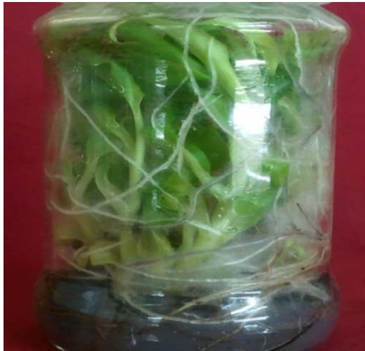
Figure 4. In vitro rooting.

tried, only 3 treatments (MS half strength) with IBA (1.00 mg/l) and activated charcoal showed maximum rooting of cultures (98.66%) which was at par with MS (half strength) with IBA (1.00 mg/l) and NAA (0.50 mg/l) registering 95.33% rooting. However, the shootlet took least time (6.33 days) for root initiation on half strength MS medium supplemented with 1.00 mg/l IBA and 200 mg/l activated charcoal. The maximum number of roots per shootlet (6.66) and the maximum length of root (7.80 cm) was produced on the medium containing 1.00 mg/l IBA and 200 mg/l activated charcoal. Treatments MS (half strength) augmented with 1.00 mg/l IBA and activated charcoal supported the maximum length of shoot (7.40 cm), which was significantly superior to the rest of the treatments tested. Considering the leaves per shoot, the maximum number of leaves (6.33) were produced on MS (half strength) supplemented with 1.00 mg/l IBA and activated charcoal. Addition of activated charcoal avoids callus formation at the base of the shoot before rooting.