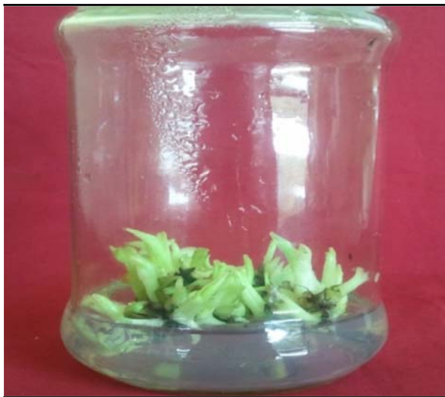
Figure 2. Culture establishment of banana explants cv. Grand Naine.

Values in bracket indicate that they are transformed values. Data recorded for different parameters were subjected to completely randomized design (CRD). Statistical analysis by (ANOVA) technique of CRD software used for data analysis is O.P. State.