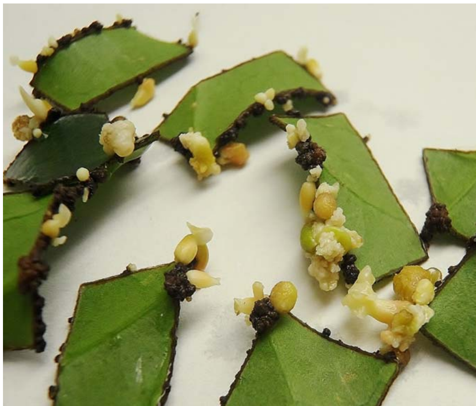
Figure 1. Formation of somatic embryos at cut edges of the leaf discs.