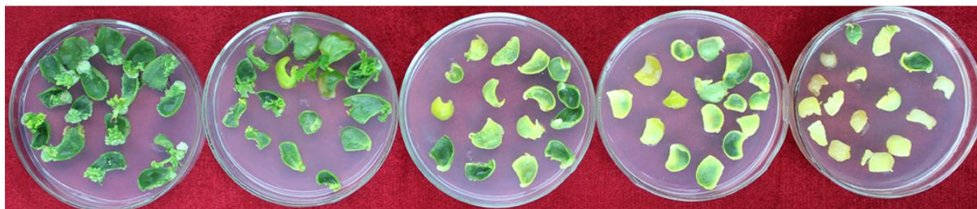
Figure 3. Effect of different concentrations of kanamycin on adventitious shoots formation from cotyledon base portion explants of the three watermelon cultivars ( Citrullus lanatus L.). Adventitious shoot was determined after 4 weeks of cultivation on induction medium. The antibiotic concentrations were 0, 50, 75, 100 and 125 mg L -1 kanamycin from left to right.