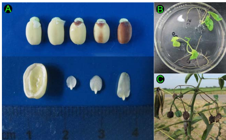
Figure 1. A) Seeds and embryos of cassava (HMC-1) at 30 to 38 days after pollination (DAP). B) Seedlings germinated from young cotyledonary embryos. C) Seeds affected by insects and diseases in the field.