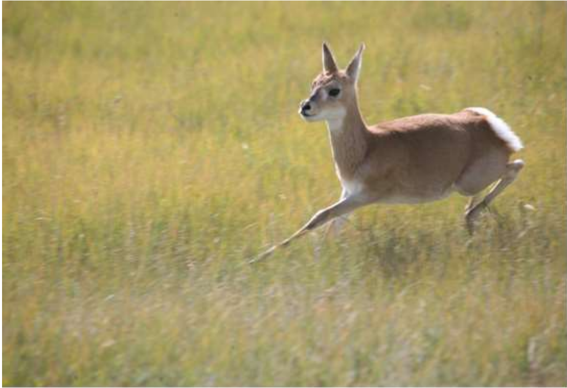
Figure 3. A running Przewalski's gazelle.