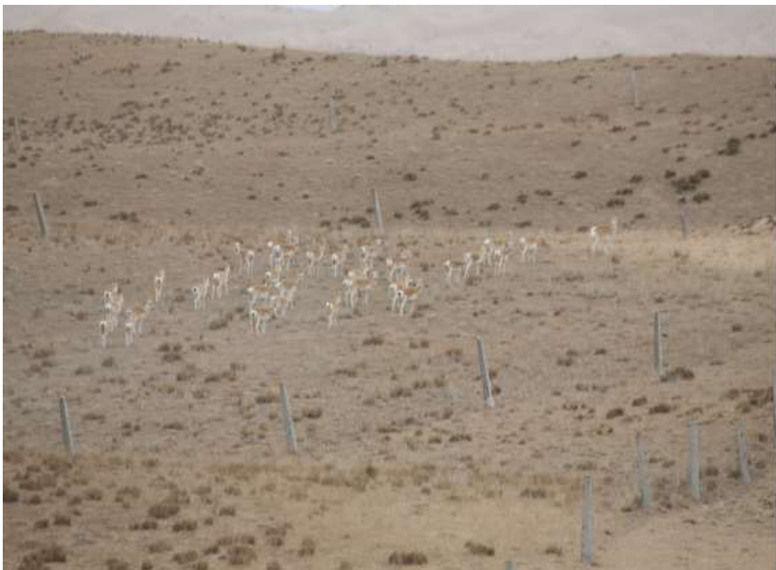
Figure 4. A Przewalski's gazelle population living in fenced paddocks.