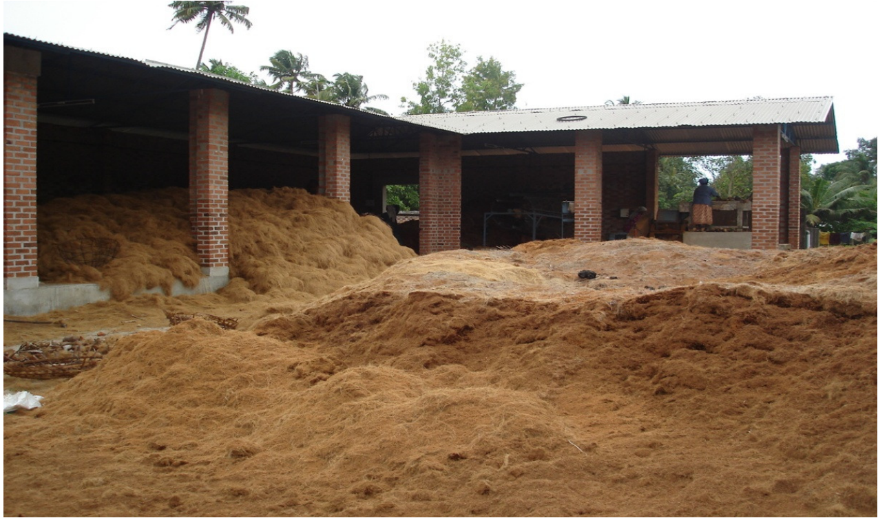
Figure 6. Coir pith heaps accumulating in fiber extraction units.

sample was Ochrobactrum sp., which has several properties of importance. The genus Ochrobactrum was described first by Homes et al. (1988) and belongs to the \alpha -2 subclass of the Proteobacteria (De Ley, 1992). Ochrobactrum tritici was identified as Bacterial strain 5bv11, isolated from a chromium-contaminated waste water treatment plant, which is resistant to a broad range of antibiotics and metals viz. Cr (VI), Ni (II), Co (II), Cd (II) and Zn (II) (Branco et al., 2004). Holmes et al. (1988) proposed Ochrobactrum anthropi as a sole and type species of Ochrobactrum , but they observed heterogeneities in geno- or phenotypic characters within the tested O. anthropi collection. O. anthropi strains have been isolated from samples originating from different continents. Ochrobactrum sp. contains root associated bacteria that enter bivalent interactions with plant and human hosts. Several members of these genera show plant growth promoting as well as excellent antagonistic properties against plant pathogens and were therefore utilized for the development of biopesticides (Weller, 1988; Whipps, 2001).