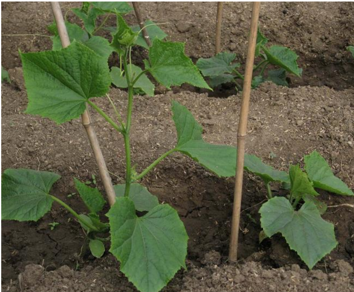
Figure 1. Young vine (left) and dwarf (right) plants in cucumber (20 days).

North Central Regional Plant Introduction Station (Ames, IA, USA). This monoecious dwarf plant was self-fertilize and all of its progenies were dwarf in appearance, suggesting homozygosis. The vine (Figure 1B) parent was a typical pure line in plant habit.