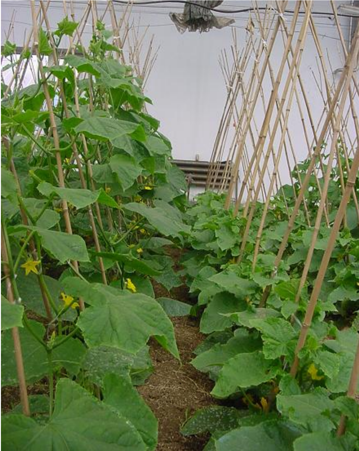
Figure 2. Mature vine (left) and dwarf (right) plants in cucumber (60 days)

difference in morphology. The dwarf line (D0460) has remarkable phenotypes including smaller flowers, less and shorter internodes, earlier flowering, shorter tendrils (Figures 1A and B). Expression of the compact gene was generally not affected by environment. Thus dwarf plants