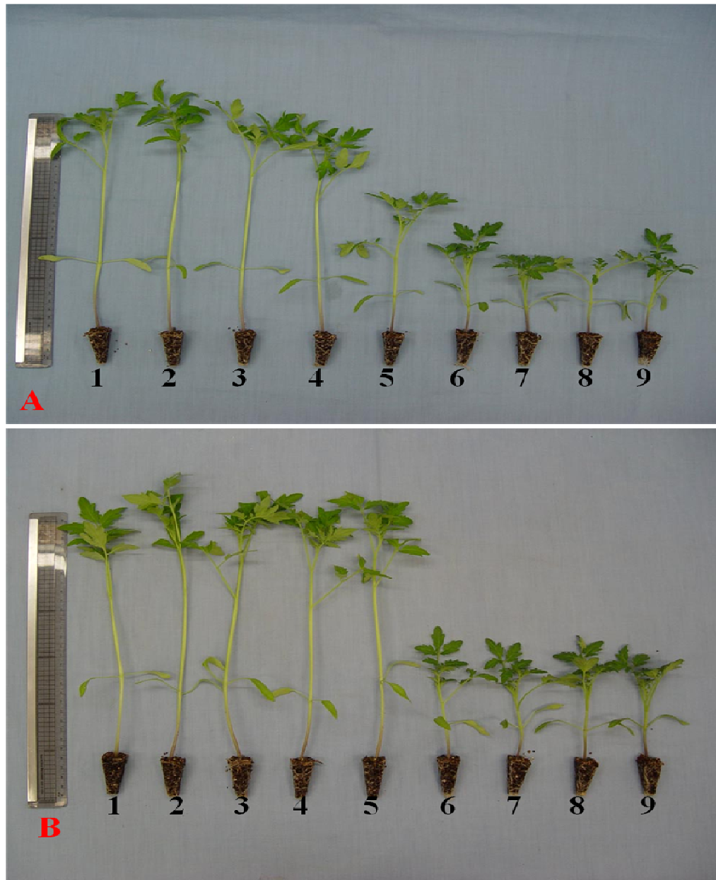
Figure 2. Effect of seed treatment with potassium silicate and uniconazole on growth of tomato seedlings measured at 32 days after sowing in plug trays. A, 'Seogeon'; B, 'Seokwang'