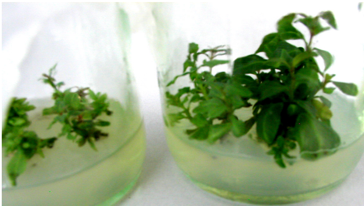
Figure 1. Eucalyptus globulus plants and the ones treated by colchicine. Note: Plants in the left bottle were Eucalyptus globulus and plants in right one were the Eucalyptus globulus polyploid.

of colchicine had the greatest effect of the stimulation and the rate of mutation was highest. Because of the highest mortality rate (60%) at the concentration of 0.5%, taking into account the induced efficiency, higher concentrations were not been conducted in the experiment. Hence, a combination of 0.5% colchicine and treating multiple shoot clumps for 4 days was the most appropriate condition for E. globulus polyploidy induction.