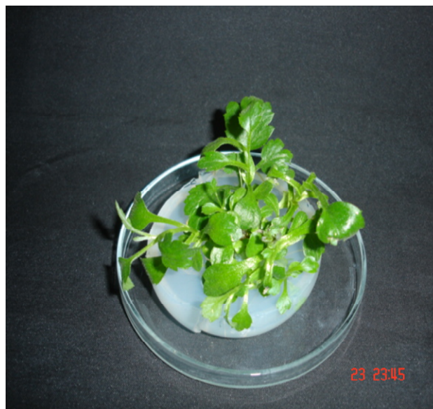
Figure 1. Shoot formation derived from ray floret explant.