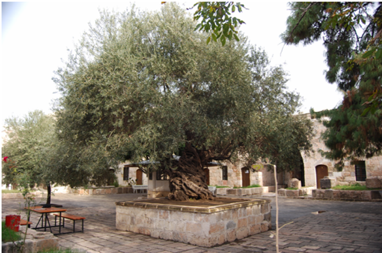
Figure 1. An example (PK) of old trees from Payas districts of Hatay, Turkey which are estimated to be more than 500 years old.

further genetic studies for the olive genotypes of the region.