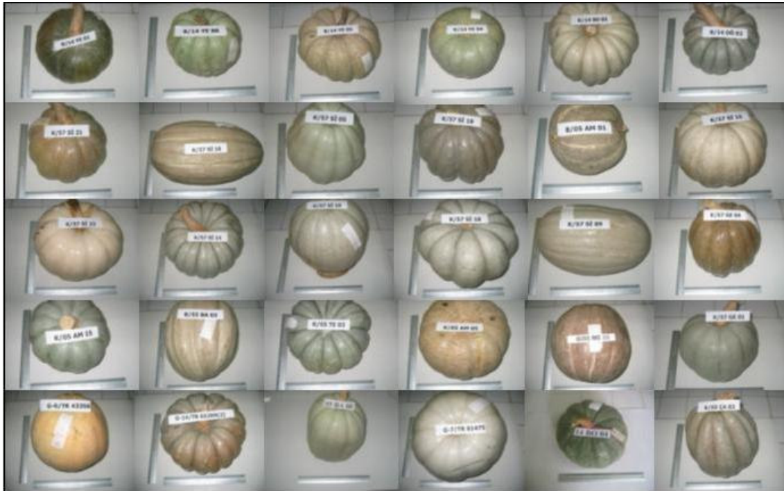
Figure 1. Picture of the diversity fruit size, shape and color for Cucurbita maxima populations which were collected from Black Sea Region in Turkey.

population of winter squash and exchanged seeds with surrounding areas, mainly at local markets. It is a traditional vegetable often grown in small gardens. However, for decades, the old winter squash landraces have progressively been replaced by new cultivars, including Arican 97, which ensure higher yields and incomes and meet the requirements of processors and consumers (Sari et al., 2008; Balkaya et al., 2009). However, the traditional landraces are the important genetic resources for plant breeders because of their considerable genotypic variations. These variations are maintained by deliberate selection for specific traits by farmers. At the research level, the diversity of genetic resources in collections may increase the efficiency of efforts to improve a species (Geleta et al., 2005). Determination of the degree of variation of quantitative and qualitative traits present in genetic resources is important for vegetable breeding programs (Escribano et al., 1998). Plant breeders can use genetic similarity information to complement phenotypic information in the development of breeding populations (Greene et al., 2004; Balkaya et al., 2009).