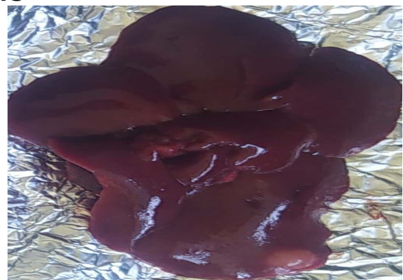
Figure 1. Gross appearance of the liver showing four lobes and dark brown in colour.

The liver gross morphometric measurements entail weight, length, width and thickness. There was no gross anatomical changes observed on the liver between the control and experimental groups. The liver was observed to have four lobes, dark brown in colour with a smooth texture (figure 1).