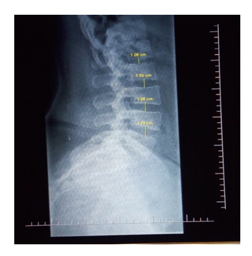
Figure 3. Measurement of Intervertebral disc height