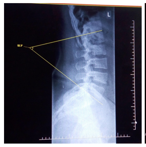
Figure 1. Measurement of Lumbar Lordotic angle