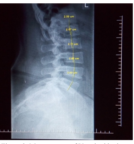
Figure 2. Measurement of Vertebral body height