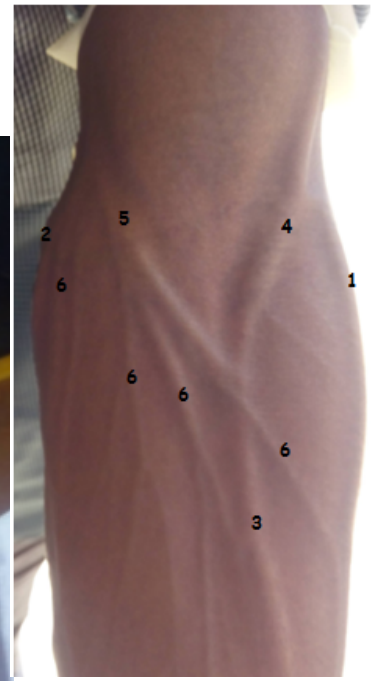
Figure 1: A Photograph showing type 1 arrangement of superficial veins in left cubital fossa. 1: Cephalic Vein; 2: Median Cubital Vein; 3: Basilic Vein; 4: Tributaries to Median Cubital Vein