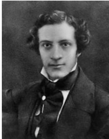
Henry Gray (1827 -1861),