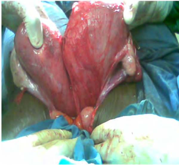
Figure 2: Showing the posterior view of the bicornuate uterus and ovaries