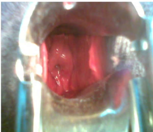
Figure 3: Speculum examination showing a single cervix.