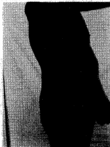
Fistula opening just superior to the iliac crest.

Examination showed a healthy looking woman with a fistula in the right flank just superior to the iliac crest, discharging intestinal contents (Fig 1).