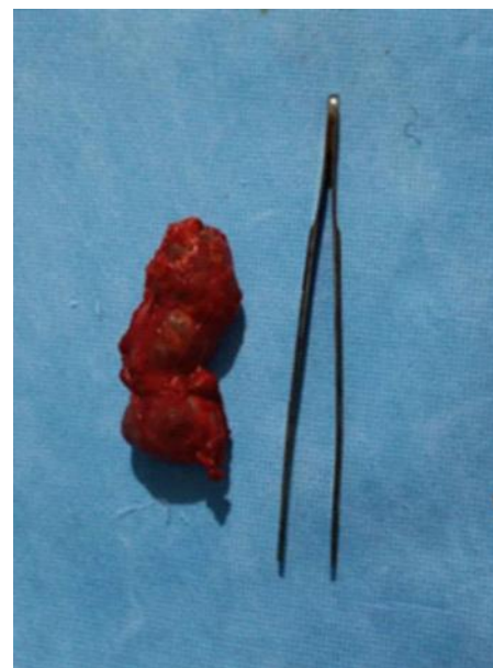
Figure 3: An 8 x 3 centimeters cyst of the canal of Nuck.

The patient was discharged on the second post-operative day. A follow-up visits to the clinic in the second and sixth post operative weeks showed satisfactory wound healing.