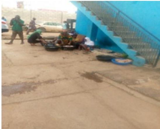
Figure 6: (Gut cleaner at work)

workers. However, the table indicates that gender ( \beta = -0.067 ; t = -0.649 ; p > 0.05 ) have no significant relative contribution to bacterial infections of abattoir workers. The implication of this result is that nature of work is a strong predictor of bacterial infections of abattoir workers. On the other hand, gender does not necessarily determine bacterial infections of abattoir workers.