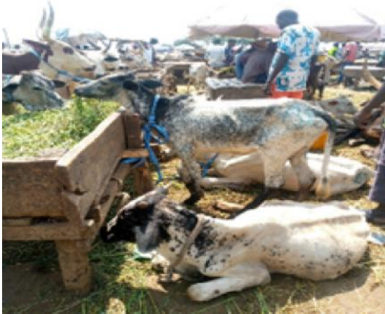
Figure 5: ( Sick , malnourish with septic skin blister)