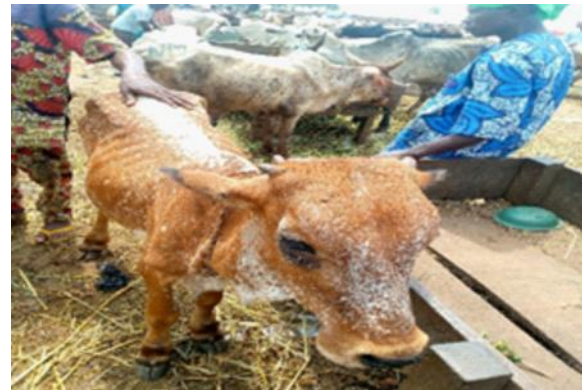
Figure 7: (Infected cow and carefree handlers)

In this study, the masculine gender had the highest number among the butcher, slaughterer and the loaders; 30, 15, 10 respectively while the feminine