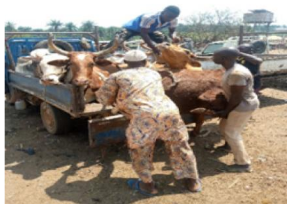
Figure 3: Loaders (Loading bay)