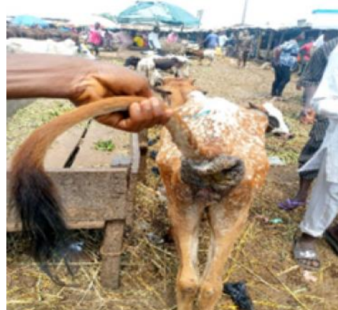
Figure 4: (budded, bleeding infected anus)