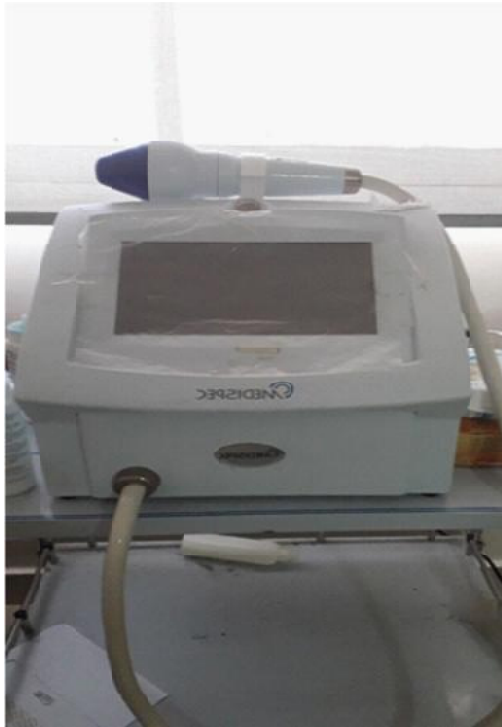
Figure 2: picture of the shockwave machine used for this study

None of the patients reported any pain or adverse events during the treatment and follow up period.