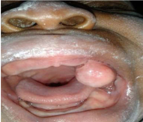
Pre-operative clinical picture