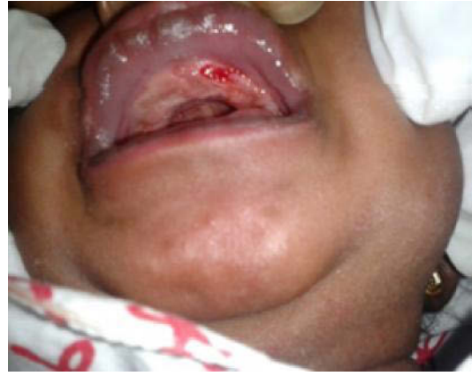
Immediate intra-operative clinical picture