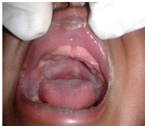
A month post-operative clinical picture

local anaesthesia and the patient was discharged and followed-up. Histopathologic evaluation revealed the mass to be congenital granular cell tumour of the newborn.