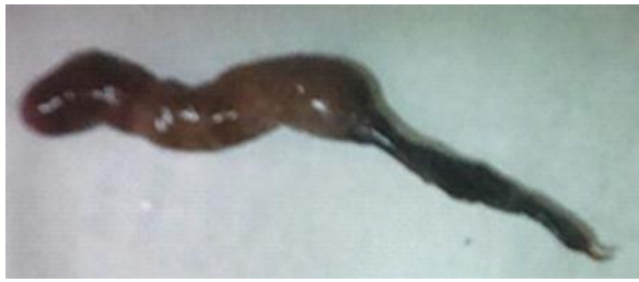
Fig. 2: The necrotic tissue after extraction

The child was catheterized, and 250mls of clear urine was drained. Laboratory investigations revealed a packed cell volume of 20% and microscopic hematuria. His renal function tests were normal. He had an abdominal ultrasound scan which showed bilateral solid renal masses with a dilated right pelvi-