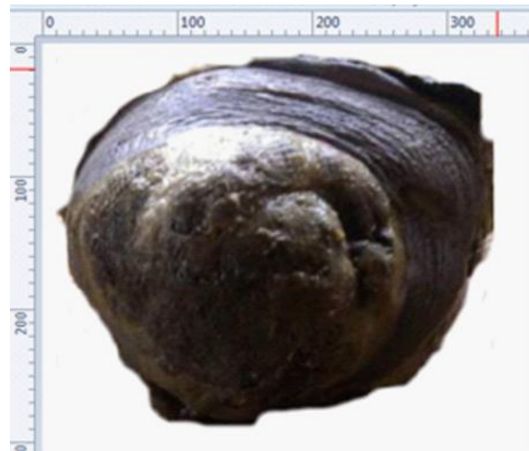
Fig. 2: Scale is in millimeter, Gross picture of the largest sacral mature cystic teratoma in a three-week old child measuring 30cm x 30cm x 10cm

During the 15 year period of the study, a total number of 6,548 biopsy specimens were received at the department. Out of these, 28 cases were diagnosed as teratomas giving an overall frequency of 0.4%. The age range was 7 days to 53 years with a mean age of 2.3 years. Nine cases occurred in children and 19 cases involved adults. Fig. 1 shows the age-group and sex distribution of the patients with teratomas. Teratomas in this study displayed a bimodal age distribution with the first peak occurring in the first decade of life while the second occurred in the third decade of life. There