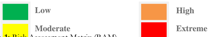
Fig. 1: Risk Assessment Matrix (RAM)