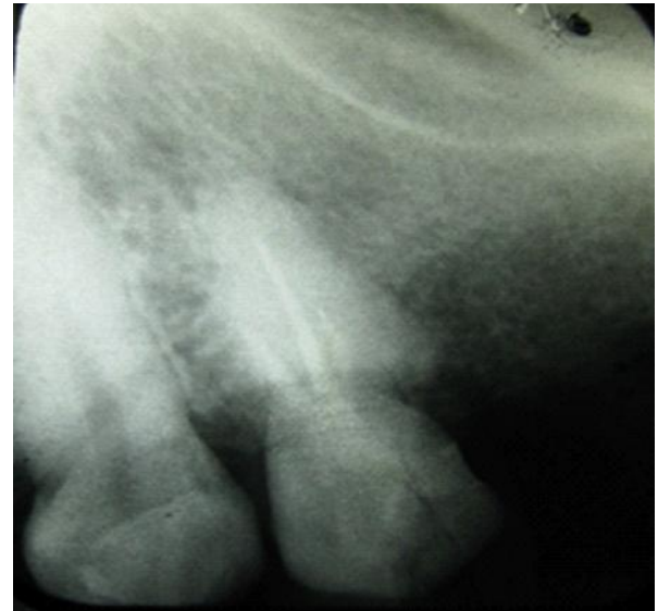
Fig 3: Periapical radiograph of the obturated canals of 4_|

Bio mechanical preparation was carried out using the step back technique with recapitulation to the original working length. Apical preparation was done to size 25file, and coronal preparation to size 35file, all under copious irrigation with sodium hypochlorite. The canals were dried with paper points and the access cavity restored with zinc phosphate cement over cotton wool pledget, A week later, the patient was reviewed and she felt slight tenderness to percussion with the base