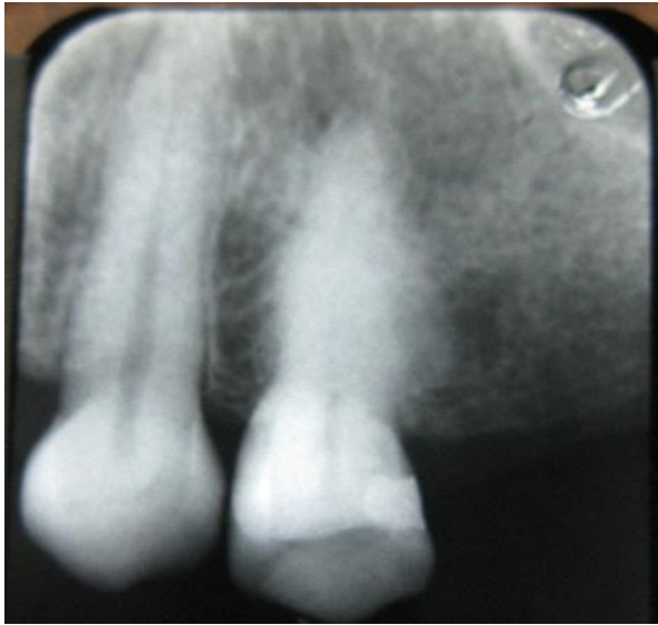
Fig. 1: Pre-operative radiograph showing 43| with the mesiodistal width of the midportion of the root of 4_| ~ the crown mesiodistal width

leading to clinical and subsequent radiographic confirmation of three canals: the palatal, mesiobuccal, and distobuccal canals [Fig2].