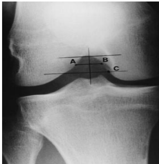
Figure 1: Measurement of INW according to Shelbourne et al 28

>80°). Machine measurements were (66-68KV, 25 MAS, 0.12 Sec) for both exposures. The intercondylar notch width was then measured as seen in figure 1 as reported by Shelbourne et al 28 . The INW is the distance between. Point A and B)