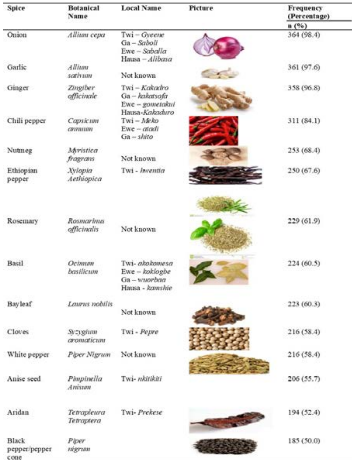
Table 3: Commonly consumed ethnic spices by respondents

pepper, the spice which was least used, was used mainly because of its taste (22.2%) and flavour (21.6%) (Table 4).