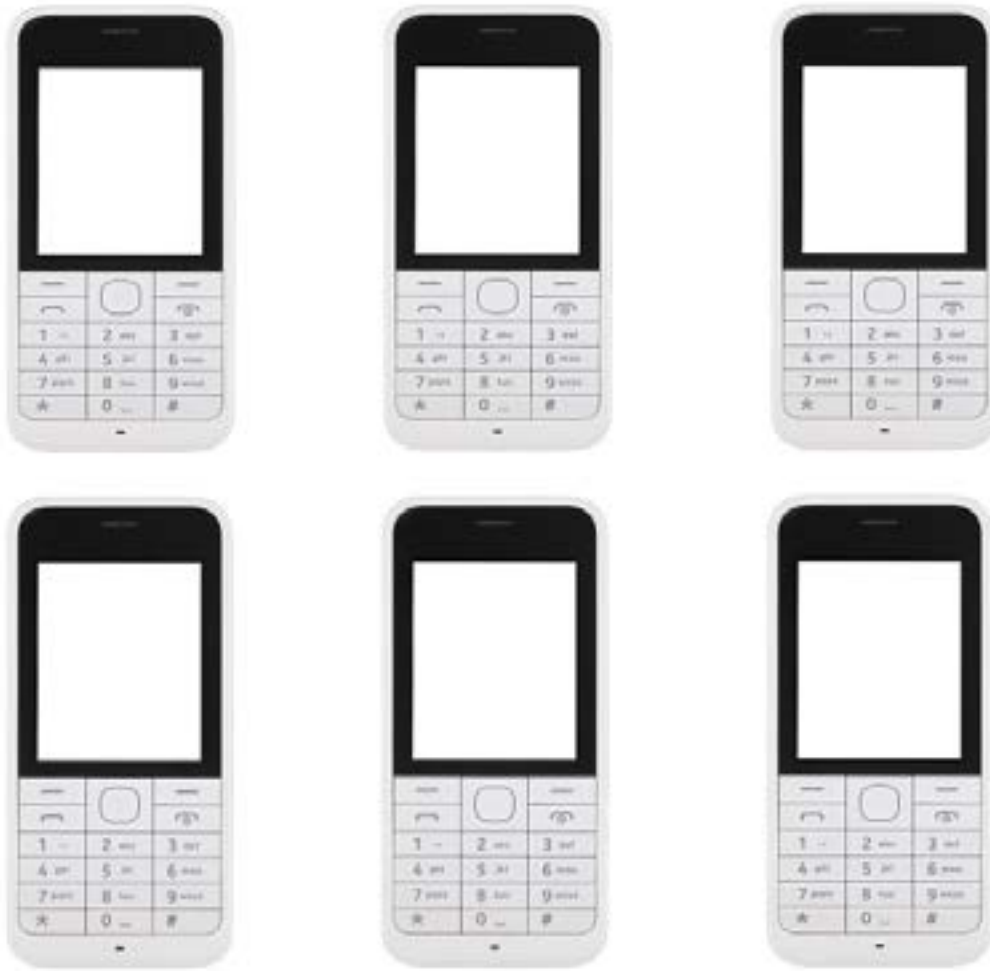
Figure 2: Illustrating the patient interface with the USSD interactions with questions adherence to medication and any current illness

Data Storage and Movement: All patient responses to the symptom questionnaire are stored within their ISS clinic facility. Aside from the symptom data, the only other patient information that is stored on the RapidPro server is the patient's phone number, their preferred language and a four-digit PIN that they use to access the system. The remainder of the patient-specific data is stored separately on the ISS clinic -hosted server, along with clinician login credentials and clinician-recorded notes. The dashboard would then use patient phone numbers, which is stored on both the ISS clinic and RapidPro servers, to query data from both databases and to present it to the clinician in an efficient manner.