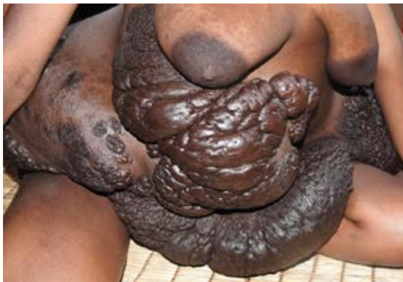
Figure 1: Giant plexiform neurofibromas 11 weeks after delivery of a healthy child

rapidly progressing size of cutaneous masses causing difficulty in breathing and inability to walk or lie down (Figure 1).