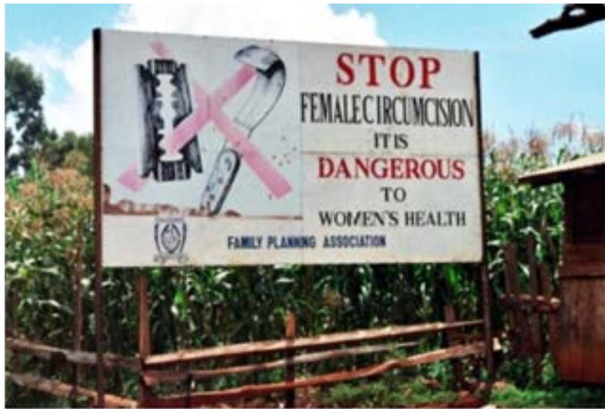
Figure 4 43

As it is evident, apart from other aspects; a significant part of "Anti FGM Campaign" is based on education and educational programs. That's why the Governments, NGOs and international and regional organizations use mass media (especially radio and television networks), Billboards and posters, public meeting and lectures in Schools and Universities to increase public awareness of the dangers and harms of Female Circumcision. 44 Also, since education plays an important role in reducing the rate of FGM in Horn of Africa, it has been found that educated parents who also care about their daughter's education, are less likely to practice FGM. For this very reason, Governments and non-governmental organizations in the Horn of Africa have made extensive effort to familiarize girls with their