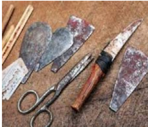
Figure 2 5

act of cutting part of the female genital usually without any kind of sanity, only to observe old ethnic customs of tribes. In Horn of Africa, as well as other regions of Africa, female circumcision is often done in traditional styles, without using sterile and sanitary tools, accompanied with pain and aching. This is done by cutting a part of the girl’s genital, using cutting utensils such as knives, scissors, ruler, blade or even a piece of glass and then stitching it up with thread; thereafter, things like oil, honey, yogurt and tree leaves are applied to stop the bleeding. 4 Figure 2 shows Traditional women's circumcision tools in Northeastern Africa - rural areas.