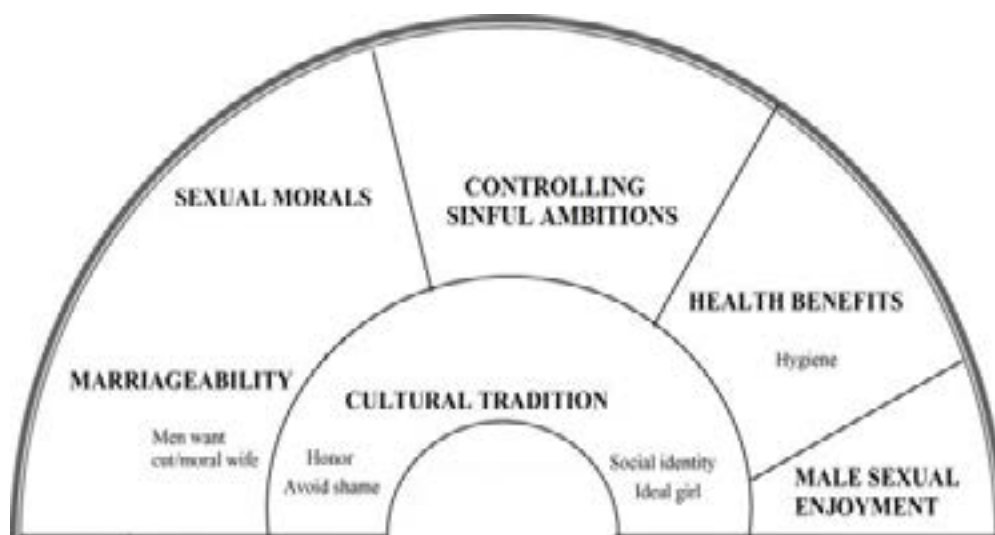
Figure 3 32

Additionally, according to traditions, people of this region believe that circumcision is a way of an introduction that the girl has entered puberty and is ready to get marry and make a family 27 . In the other words, female circumcision is considered as a value at the time of marriage, in a way that if the virginity of the bride could not be identified on the first night of the marriage, the groom's family can bring her back to her father's house. Other than that, many young men are unwilling to marry the uncircumcised girls. Even the amount of Cabin (dowry) for a circumcised bride is more than those who have not been circumcised 30 . Health benefits and male sexual enjoyment are also factors in the continuation of the practice, albeit less influential ones. 31 Figure 3 displays the conceptual model of factors perpetuating FGM in Northeastern Africa.