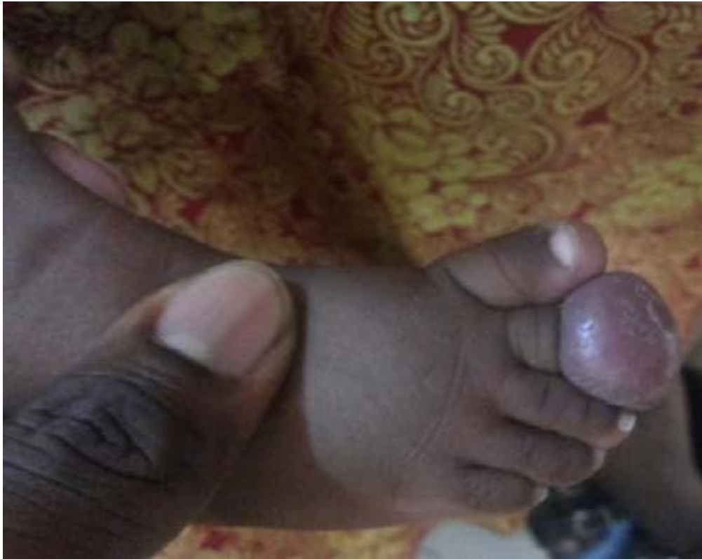
Figure 1 showing soft tissue mass on the second toe.