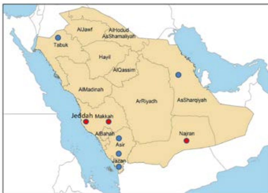
Fig. 1 Regions in the Kingdom of Saudi Arabia, where people were infected with Alkhurma Hemorrhagic Fever Virus (AHFV). Red circles designate the areas with confirmed AHFV cases, while blue circles designate the areas of serologically positive individuals 17 .

Alkhurma hemorrhagic fever virus (AHFV) was initially isolated from a butcher in the year of 1995, who slaughtered a sheep in the Alkhurma region and was admitted at Soliman Fakeeh Hospital, with hysterical symptoms of fatal hemorrhagic fever 3 . Accordingly, the name 'Alkhurma' was later approved by the International Committee for Taxonomy of Viruses, relating the nomenclature of this virus to the village 'Alkhurma' in the Kingdom of Saudi Arabia 4 . Subsequently, many new cases followed in the KSA, with similar symptoms and clinical manifestation 5 . It is worth noting that the national epidemiology of the AHFV is yet to be uncovered in this country 4 . Fig. 1 showed the areas in KSA that were affected by AHFV; this Figure was constructed based on the limited targeted surveillance, in which the confirmed cases in regions affected by AHFV are highlighted in red colour, while the possible diagnosis, based only on positive serology of investigated cases, are highlighted in blue.