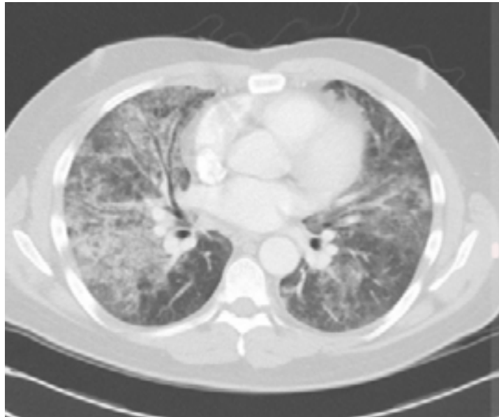
Figure 2: Diffuse ground-glass opacities, thickening of interlobular septa and linear opacities (arrows) in a chest CT-scan of a HIV-infected patient with PCP. Source: Zhao JB. Pneumonia in immunocompromised patients . Medscape. 2017. Available at: https://emedicine.medscape.com/article/807846-overview 21