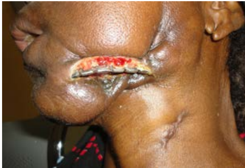
Figure 5: Reconstruction plate extrusion as one of the complications

(80.6%) had successful take. Reconstruction plate extrusion (Figure 5) was observed in 2 (4.8%) patients (n=42). There was satisfactory outcome altogether in 32 (80.0%) patients (n=40), while outcome in 12 (33.3%) patients was unknown due to loss in follow-up (Table 4).