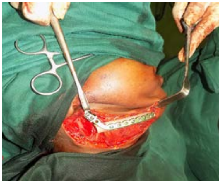
Figure 3: Clinical photograph of mandible reconstructed with a titanium condyle and rib graft

Only 1 (1.9%) patient had the mandible reconstructed with a titanium condyle and rib graft (Figure 3). Eleven (21.2%) patients were reconstructed with rib graft alone (Figure 4) and 4 (7.7%) had their mandibles reconstructed with rib graft and cancellous bone graft from the proximal tibia (Table 3).