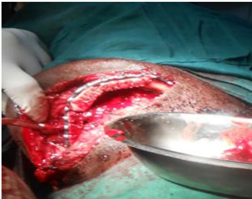
Figure 2: Clinical photograph of mandible reconstructed with titanium reconstruction plate and iliac bone graft only