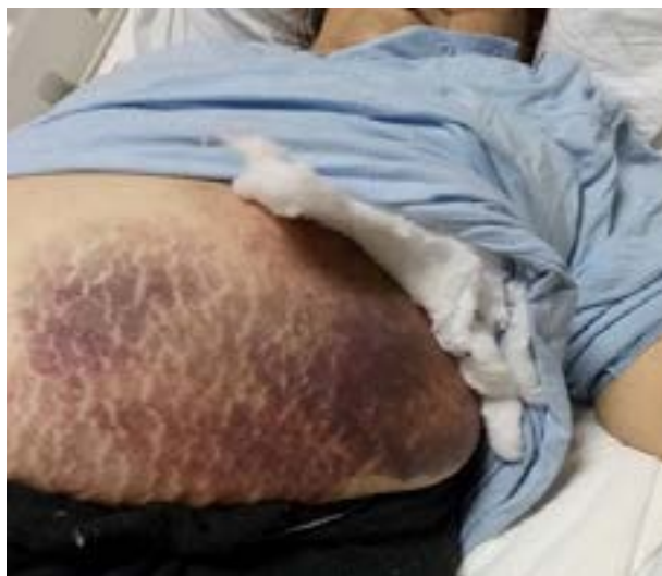
Wide ecchymotic area on anterior abdominal wall extending to the left lumbar region.