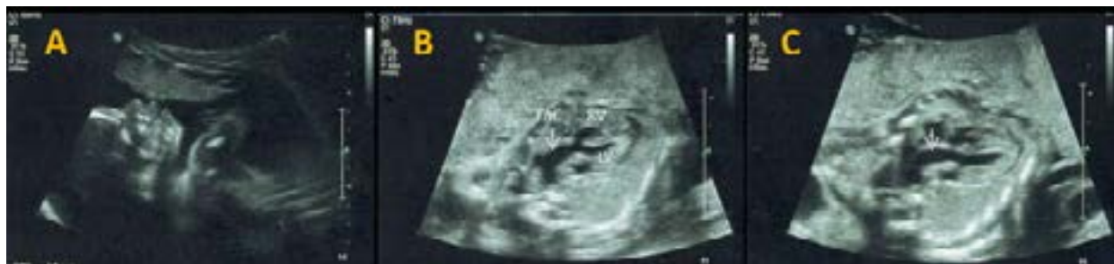
Figure 2. TAC ultrasound imaging.

Two-dimensional and three-dimensional fetal echocardiography performed in two cases: F1 (figure 2 B-C) and F3 allowed to easily diagnose the TAC and interventricular communication (IVC).