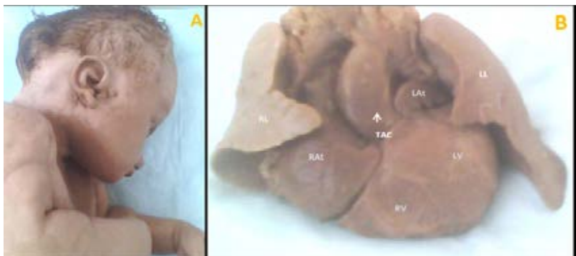
Figure 3. Extracardiac abnormalities associated to TAC.

FISH analysis revealed 22q11.2 microdeletion in fetus 3 (figure 4D). On the other hand, it was found that no anomalies were in fetus 1. FISH results for fetus 2 were uninterpretable due to the bad preservation of tissues. All data on fetal outcomes are summarized in table 1.